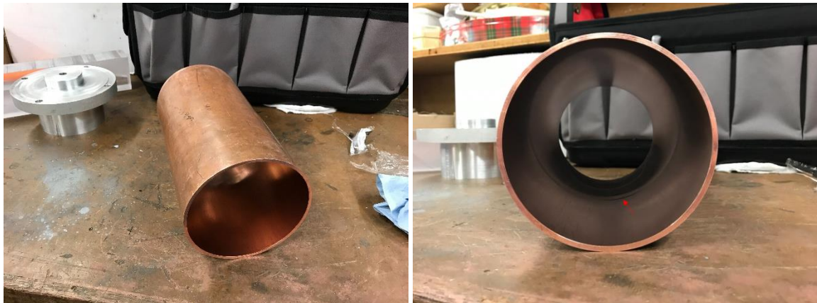
Figure 4: Copper tube after being polished. You can notice a visible scratch on bottom of the right hand image (red arrow), which is from our attempt to lathe out the inside. This scratch was difficult to remove and was simply polished later until smooth to feel.