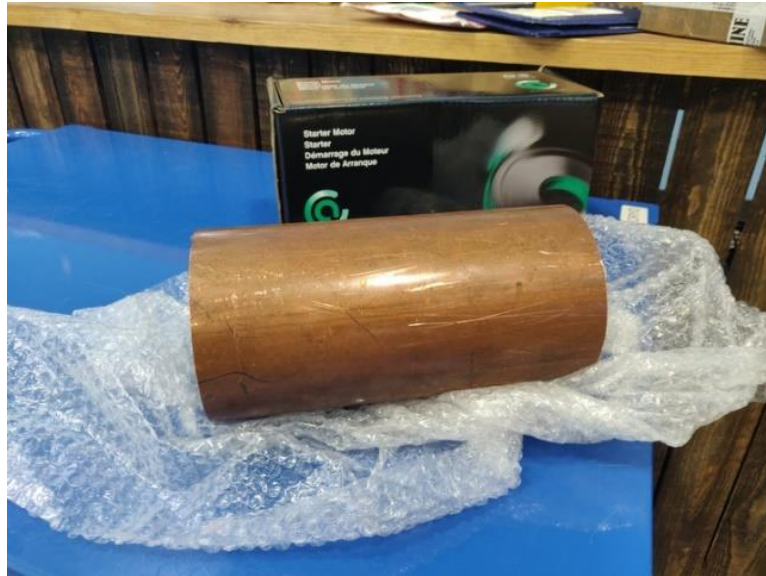
Figure 3: Stock piece of copper used for White Dwarf, before having any machining done. This is a 5" OD, 10 swg tube, material C106 copper.