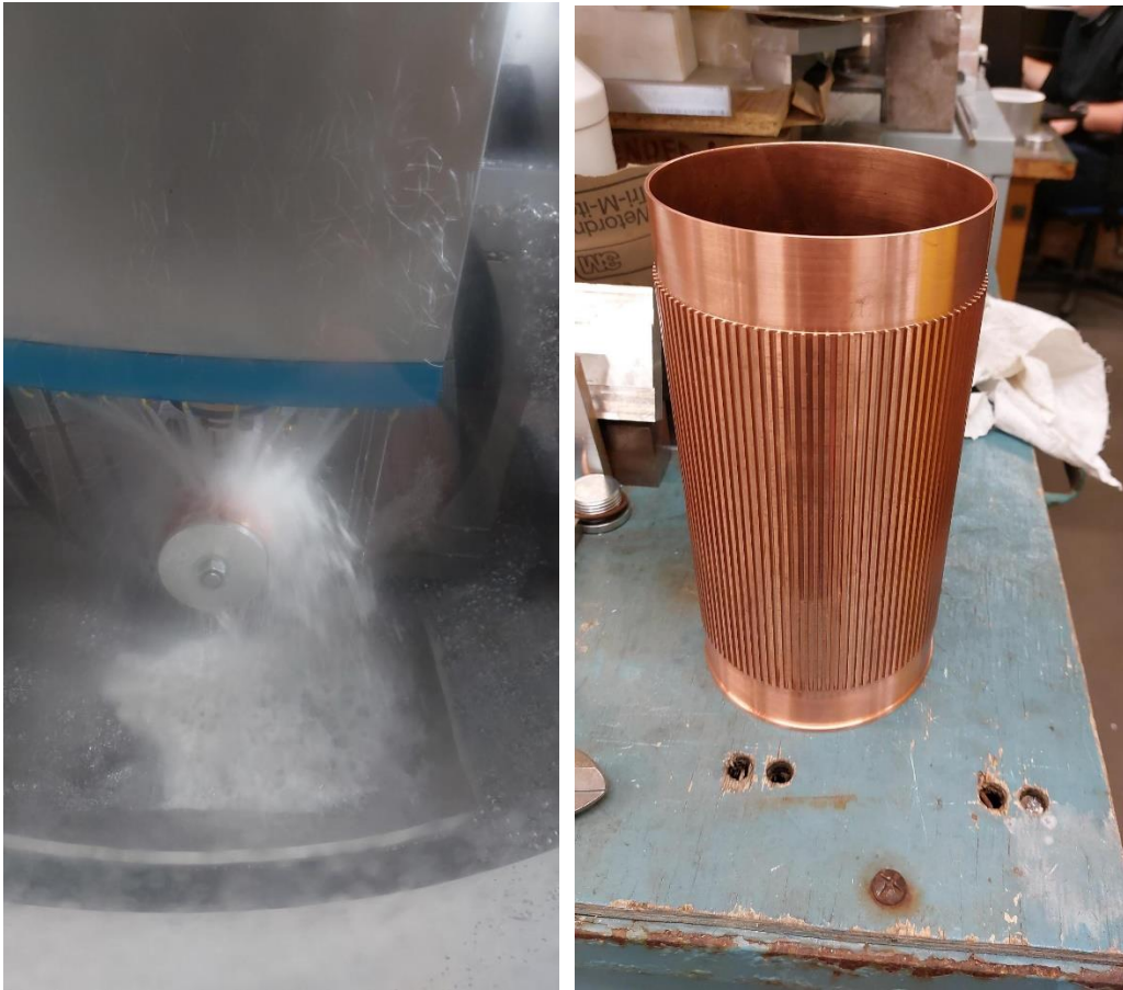
Figure 5: Copper channels being milled into the outside of the tube (left), and the finished combustion chamber wall (right).